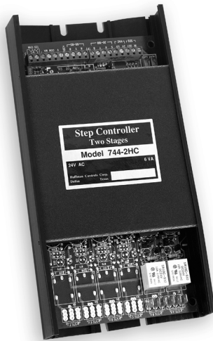
744-HC Series Step Controller