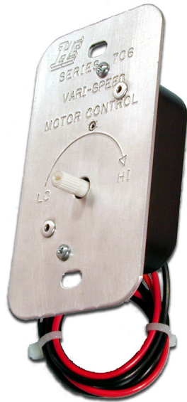
760-ECM Manual ECM Motor Speed Controller

The 760-ECM Series Controllers are available with a finger friendly adjustment knob in a track mount package (wholesale) or a standoff mounted unit that requires adjustment via a potentiometer tool (OEM).