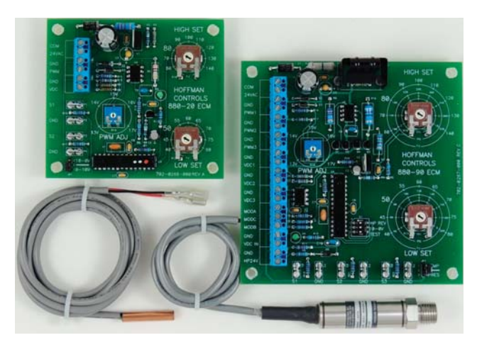
880-ECM(10)SSHP Head Pressure Controller