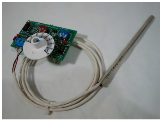
904/745=OBS(40)H or C 50°-90°F