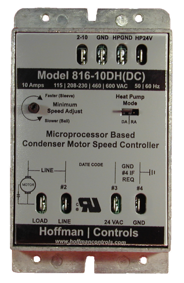
816-10DH(DC) Electronic Head Pressure Controller

A variable Minimum Speed Adjustment is available to compensate for the bearing type employed by the fan motor. A minimum of 400-RPM for sleeve bearing motors, and 200-RPM for ball bearing motors is recommended. The primary of this 24V AC transformer must be the same line (phase) furnished to the motor.