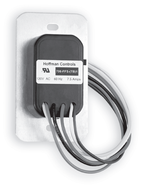
706-FFS (TB) Series Furnace Fan Speed Controller (Patent Pending)