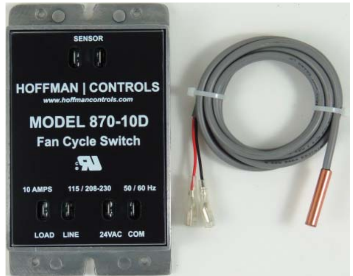
870-10D ECM/PSC Fan Cycle Switch Temperature Based Electronic Head Pressure Control